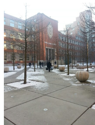
Icy arrival at CHRU Lille