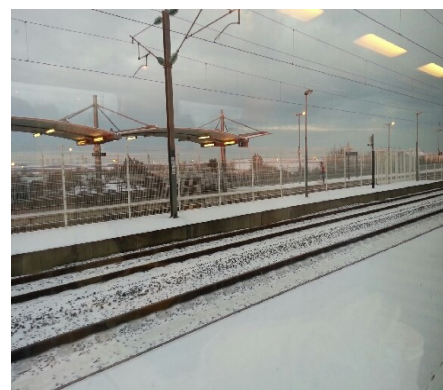
Emerging from the Channel Tunnel to a snowy French landscape

Lille hope to recruit at least 4 pairs to the trial up until the end of April 2013. We are delighted that they recruited their first pair on the 27th January.